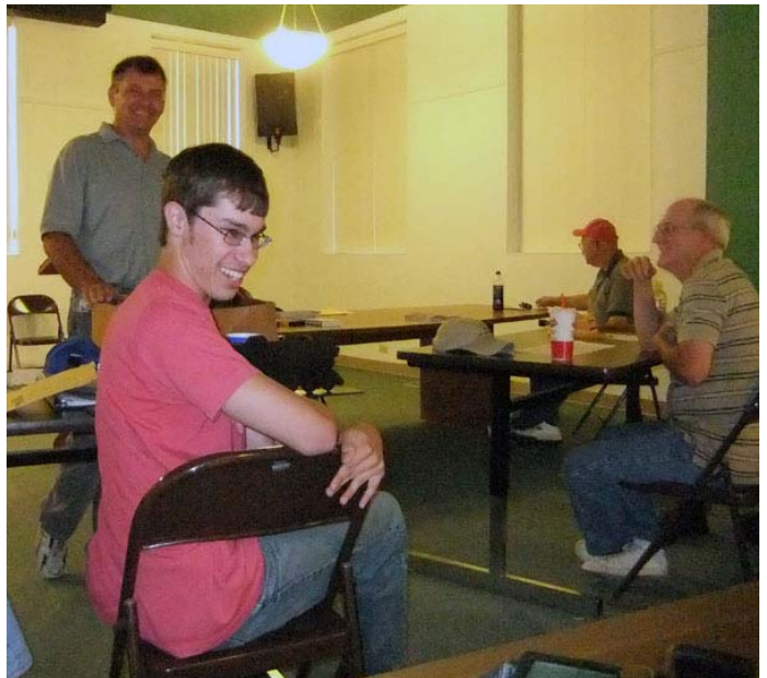
July meeting